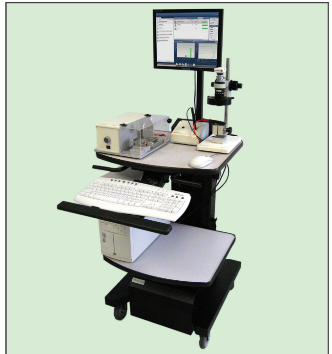
NB Series Workstation by Newcastle Systems

Shipping accuracy has improved since the order picking printer and label printer are always within arms length, eliminating a lot of unnecessary footsteps to a static workstation.