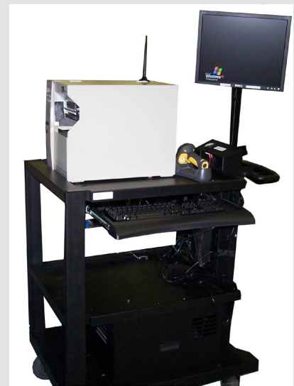
PC Series Mobile Powered Workstation