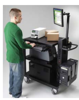
Now, labels can be changed in seconds.

This 18" \times 20" slide-out shelf can easily support your high-volume label printer or other equipment up to 60 lbs. in weight.