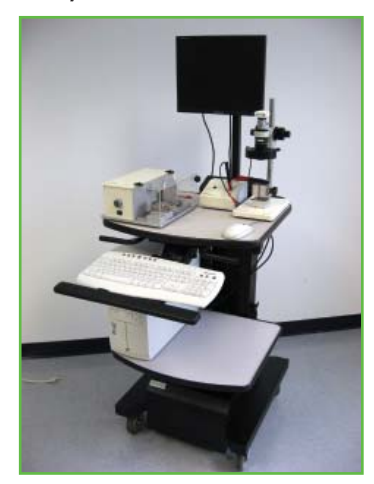
Manufacturing / Quality Assurance