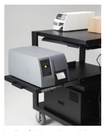
In-Stock Now, Part # B131 Simply mounts to your existing cart shelf.