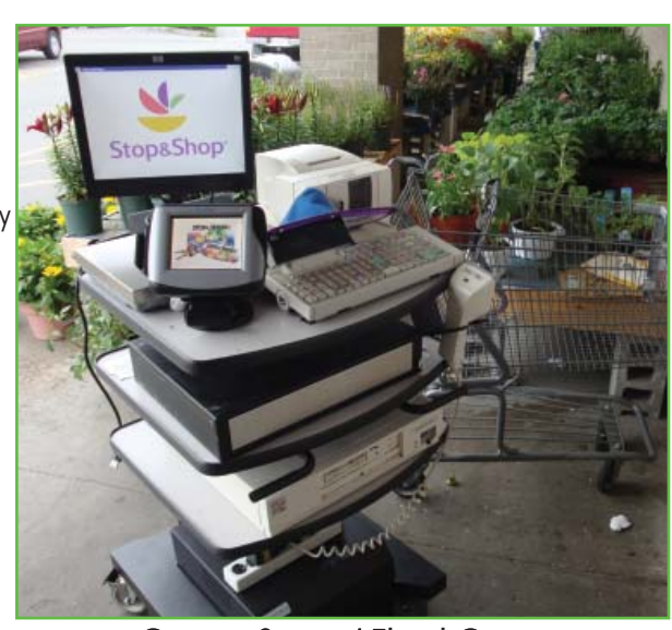
Grocery Stores / Floral Centers